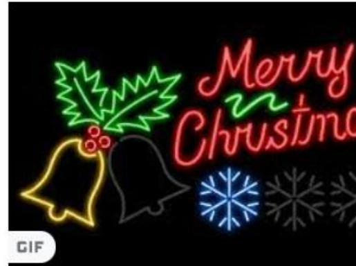
Merry Christmas GIFs - Get the best GIF ... giphy.com