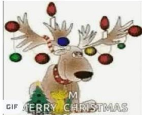
Funny Animated Christmas GIFs | Te... tenor.com