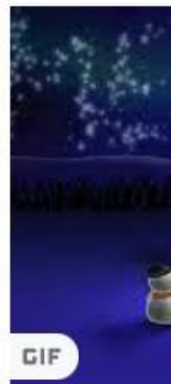
Animated chi... pinterest.nz