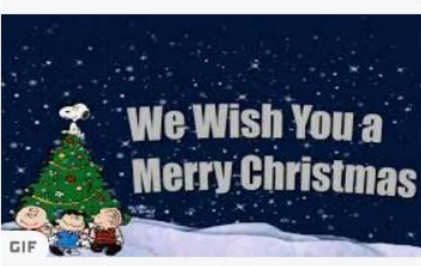
Merry Christmas Animated Gif Images ... pinterest.com