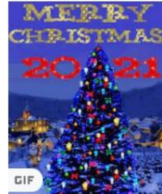
Animated Christmas GI...